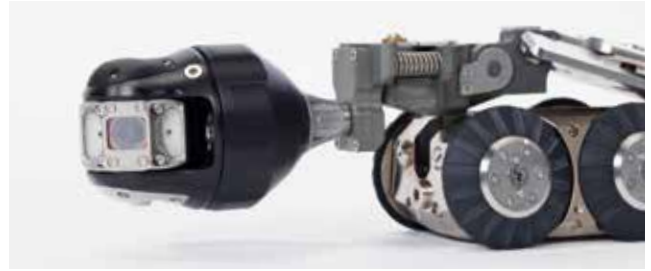
KS 60 DB camera From DN 100