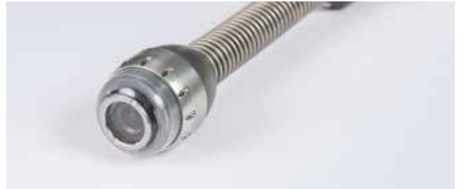
SAT 42 camera From DN 50