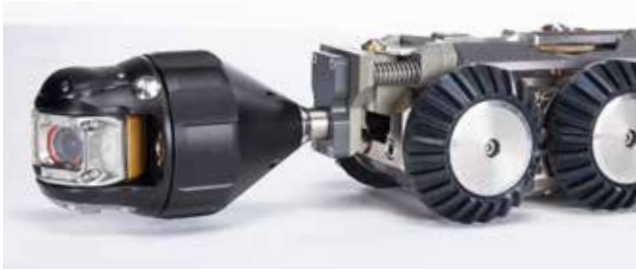
KS 60 HD camera From DN 100