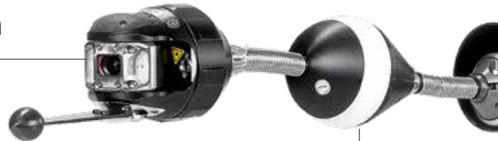
LATRAS sensor head

The Omicron can be supplemented with the LATRAS sensor head. The documentation is performed using the Rausch-Tab.