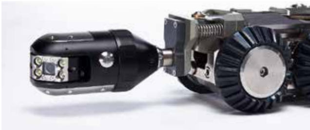
KS 40 camera From DN 75